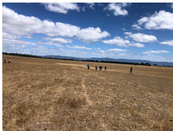
The long walk back!