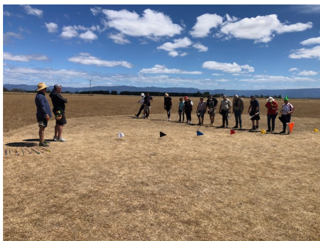
Scoring the clout – we will just ignore those arrows on the ground off to the left!