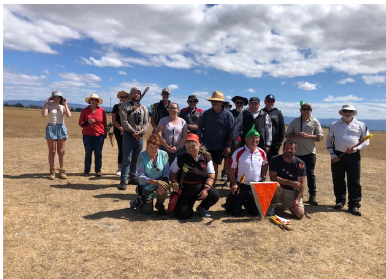
Everyone had a great day!